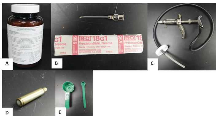
Figure 3. Equipment necessary to perform trunk injections; (A) oxytetracycline-hydrochloride (B) syringe (C) injector (D) injection valve (E) measuring spoons.

injecting fewer than 30 trees, mix individual doses. One teaspoon (2.9 g) of OTC mixed with three milliliters (3 ml) of distilled water makes a dose for one palm. A full bottle of OTC-HCl (86 g) will treat about 30 palms, and if at least 30 palms will be treated, 90 milliliters (90 ml) of distilled water can be added directly to the bottle. Regardless of the amount prepared, stir the solution until all powder dissolves. Fill a syringe by inserting the tip into the OTC-HCl solution and drawing back the plunger, or if the syringe is attached directly to the jar, prime it by retracting the pump handle until the glass cartridge is full. Once the syringe with OTC-HCl solution is ready, choose a location on the trunk for injecting. Using a 5/16-inch drill bit that is six to eight inches long, drill a hole into the trunk at a slightly downward angle (Figure 4) to a depth about equal to the drill bit (i.e., drill the hole until the drill chuck touches the trunk, about 6 to 8 inches deep. Next, insert the injection valve into the hole narrow end first, and gently tap it in flush with a hammer. Insert the syringe needle into the valve to the base of the needle and inject the OTC solution into the palm (Figure 4). Once all five milliliters of OTC have been injected, remove the syringe. If more than one tree will be injected, flame sterilize the drill bit and cool it before drilling the injection site in the next tree.