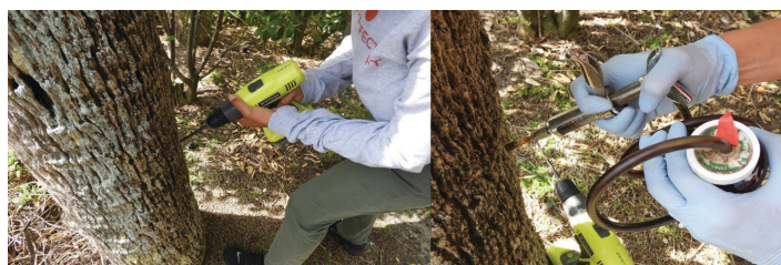
Figure 4. Injection of OTC into a cabbage palm ( Sabal palmetto ); drilling of hole (left) insertion of syringe into valve and injection (right).